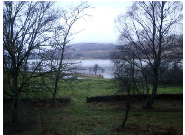
Fig. 4: Existing access off Invertrossachs Rd Fig. 5: Site and stone wall visible from track

3.4 The proposed design of the development is a linear building, orientated to the north-east of the site to take advantage of the views and location adjacent to the loch, outwith the identified flood risk area (as shown in Figure 6 below).