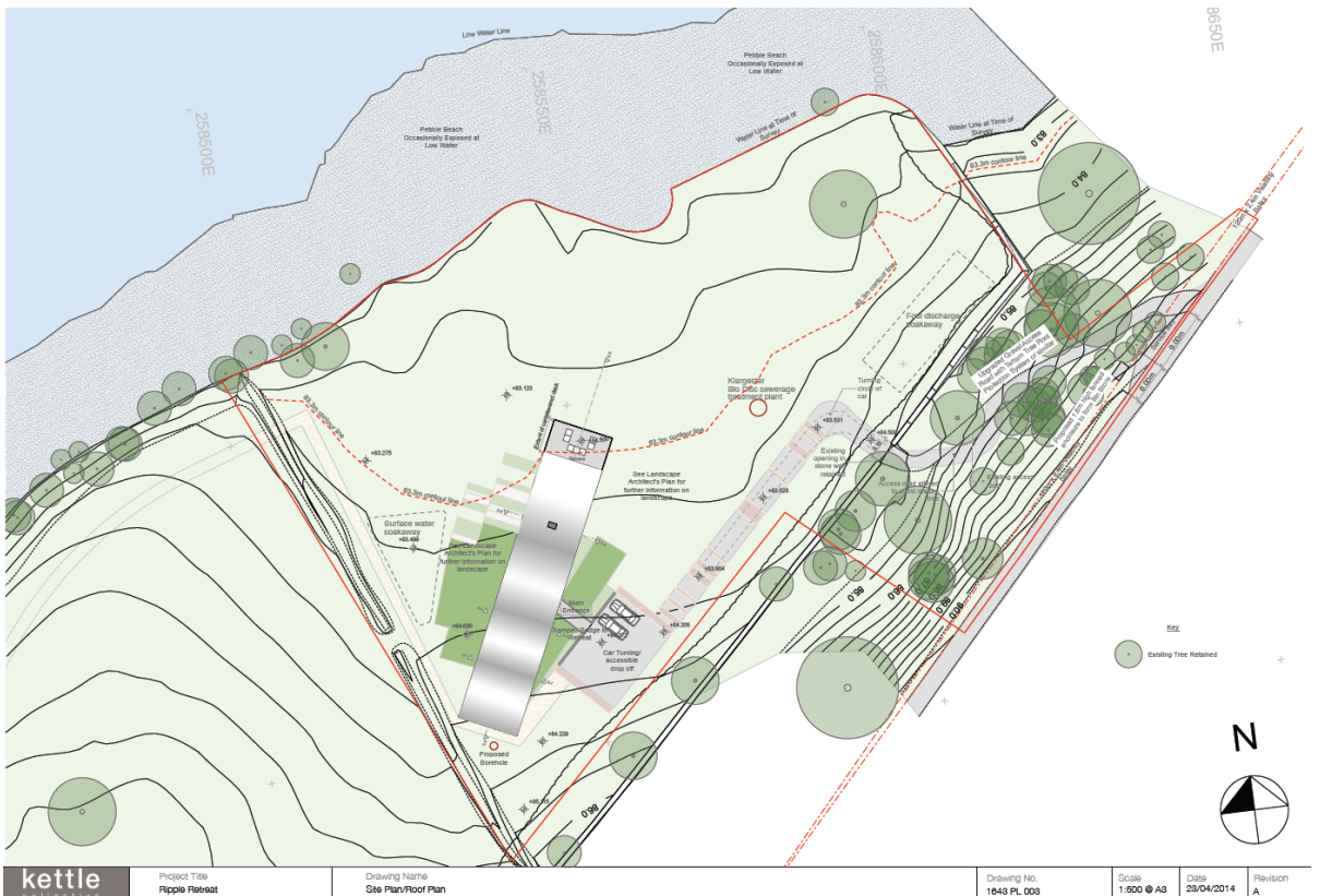
Fig. 6: Proposed layout.

3.4 The proposed design of the development is a linear building, orientated to the north-east of the site to take advantage of the views and location adjacent to the loch, outwith the identified flood risk area (as shown in Figure 6 below).