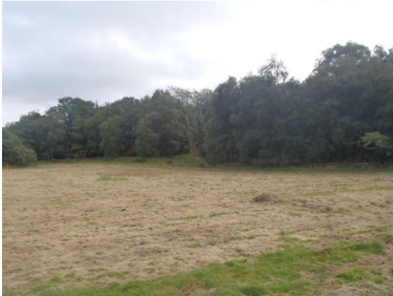
Fig. 3: Existing site looking southeast.

3.3 The site is adjacent to Inverrossachs Road, which is a core path and forms part of National Cycle Route 7. The site is accessed from an existing track off the road, through a pocket of ancient woodland. An attractive dry stone wall is located on the roadside boundary (as shown in Figures 4 and 5 below).