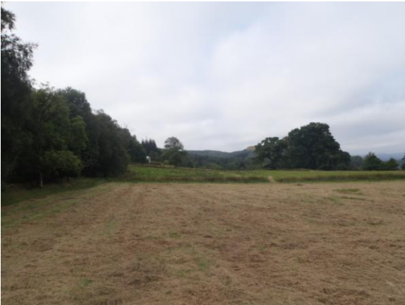
Fig. 2: Existing site looking west.

3.2 The site is the eastern area of a field associated with the house and grounds known as 'West Dullater'. The site is on a gentle slope, rising from the loch towards the south west (as shown in Figures 2 and 3 below).