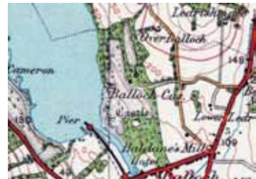
Ordnance Survey Popular edition map 1923