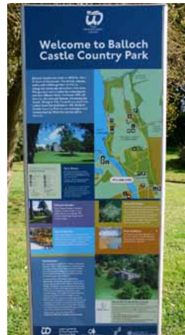
Country Park information sign