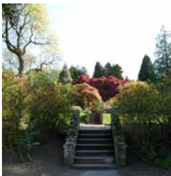
ABOVE Two views of Chinese garden

areas. North of the castle a narrower route leads past the former orchard (? , now young woodland) to Horsehouse Wood and the north of the site.