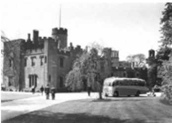
Balloch Castle, Valentines postcard, 1930s