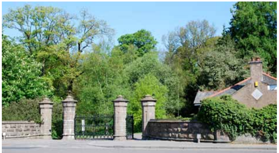
South gateway and lodge

The designs for the three castles built by Robert Lugar in Dunbartonshire were published in 1811 and were influential in the development of secular Gothic style. Balloch apparently incorporates an earlier plainer building. The house is currently underused with no public access and the café closed; some office use. A high level of car parking in the forecourt, packed with cars while the main car park was virtually empty at time of visit.