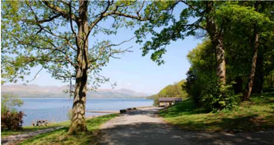
Lochside path and boat-house (Slipway café)