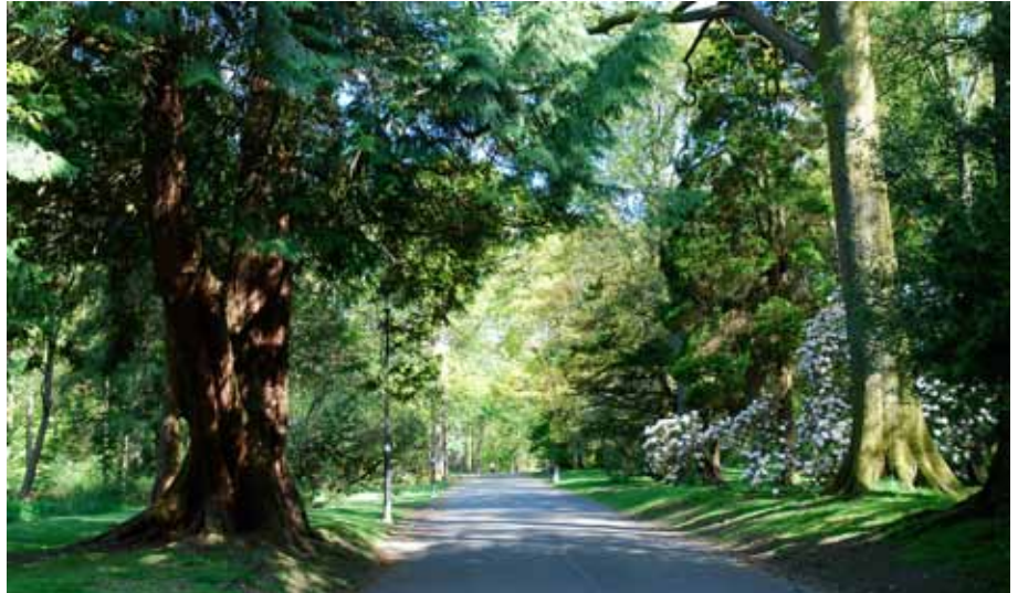
Main (south) drive