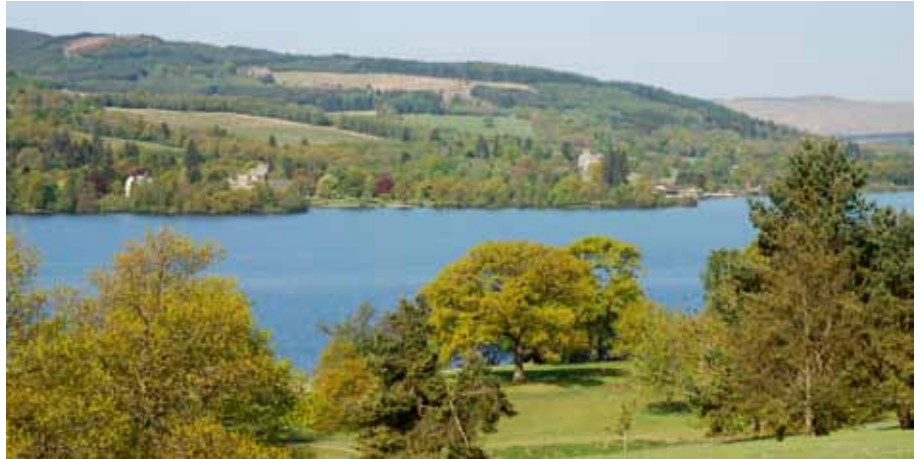
View from Balloch Castle to Cameron House (14) and Auchendennan (07)