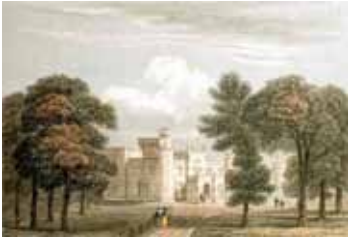
Balloch Castle, Neale engraving, 1820s