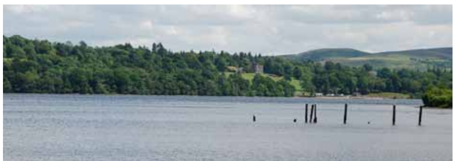
Balloch Castle seen from west shore of loch near Auchendennan (07)

Boturich Castle designed landscape (01) adjoins to the north and the site faces Cameron House designed landscape (14) across the loch, with other sites further north.