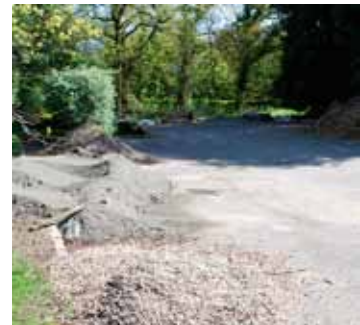
Material compound east of stables