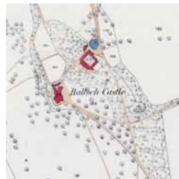
Ordnance Survey 25" map 1861