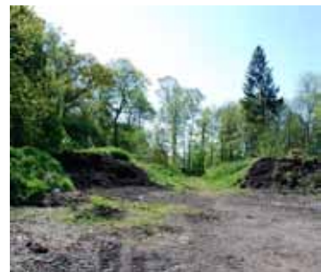
Work area in South wood