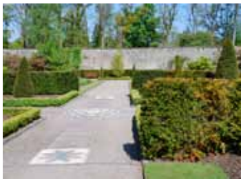
Walled garden central path